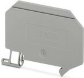
Partition plate, length: 69.7 mm, width: 2.2 mm, height: 52.5 mm, color: gray

Please be informed that the data shown in this PDF Document is generated from our Online Catalog. Please find the complete data in the user's documentation. Our General Terms of Use for Downloads are valid ( http://phoenixcontact.com/download )